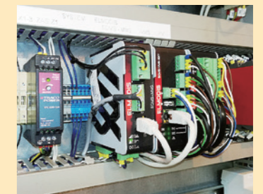
Example of a remote monitoring system installation

Then, in January 2024, Meidensha launched a new service in which any abnormalities detected by this system will be monitored by its customer center, providing customers with the support they need around the clock, every day of the year. This is an example of how we are expanding the value we offer.