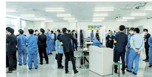
Mirai Theme Community

The MAST Project name is an acronym of "Meidensha," "ashita" (tomorrow), "sozo" (creation), and "thinking," while also carrying the meaning of a ship's mast. The MAST project emphasizes dialogue that brings people together so they can share their wisdom. When people working on a theme are exposed to other people's ideas and information, it helps them to grow and fosters the development of themes from individual ideas to actual businesses. In concrete terms, participants approach each theme from both a technical development and business development perspective. As they do so, they polish up their business ideas and collaborate with business divisions and internal and external experts. To promote exchanges among people, we also regularly convene the Mirai Theme Community, making it easier for colleagues to come together.