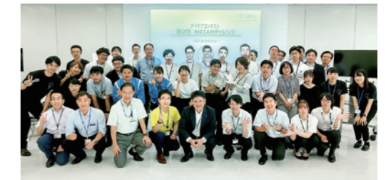
MEIAN Challenge Idea Contest

Moreover, to create new businesses, we are actively searching for start-ups with the potential to bring business synergies with us and pursuing co-creation initiatives with partner companies. We use venture capital funds and other resources to lead these efforts. We will continue such innovation initiatives that lead to the creation of new businesses while emphasizing the need to connect proactively with parties outside the company and facing the latest world trends and social issues.