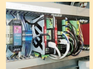
Example of a remote monitoring system installation

Then, in January 2024, Meidensha launched a new service in which any abnormalities detected by this system will be monitored by its customer center, providing customers with the support they need around the clock, every day of the year. This is an example of how we are expanding the value we offer.