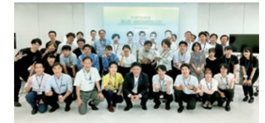
MEIAN Challenge Idea Contest