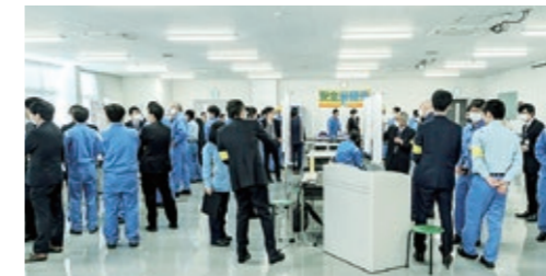
Mirai Theme Community

Moreover, to create new businesses, we are actively searching for start-ups with the potential to bring business synergies with us and pursuing co-creation initiatives with partner companies. We use venture capital funds and other resources to lead these efforts. We will continue such innovation initiatives that lead to the creation of new businesses while emphasizing the need to connect proactively with parties outside the company and facing the latest world trends and social issues.