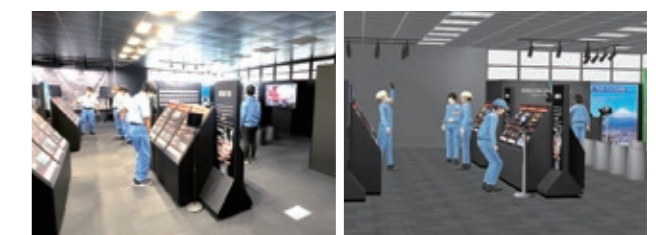
Safety Promotion Center (actual scene shown on left, metaverse simulation on right)

While the Safety Promotion Center has a physical exhibition space at Numazu Works, for employees who live too far away to visit the museum, a new Metaverse Safety Promotion Center has opened as of October 2022, utilizing virtual space. This enables multiple employees to participate without location restrictions, whether in Japan or overseas, as long as they have a VR head-mounted display, and also allows them to exchange opinions while gathering as their respective avatars over the Metaverse.