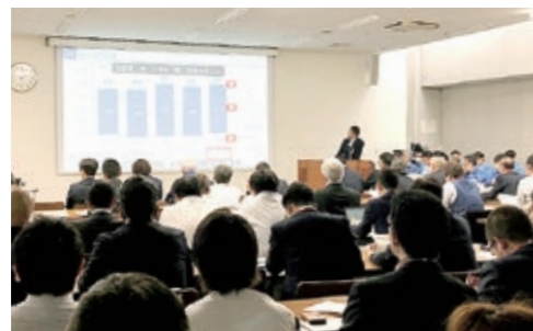
Production plan briefing at Numazu Works

When we start doing business with a new supplier, we give them the Meiden Group Sustainable Procurement Guidelines and ask them to communicate them to their own staff and adhere to them. We are also stepping up supply chain capabilities in several other ways. Each year, we hold a production plan briefing at each works, which is where production happens, to explain our basic procurement policy. We hold study sessions on carbon neutrality. We introduce the various types of support we offer to help suppliers adhere to the Sustainable Procurement Guidelines (in such areas as legal compliance, human rights, labor, health and safety, environment, quality, information security, and business continuity planning). We work on communication such as by sharing information and opinions on how to enhance technical capabilities and by showcasing examples of outstanding improvements that suppliers have made.