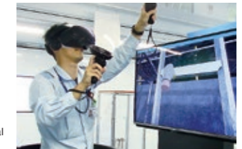
A VR hands-on safety educational program in progress

The safety education is not limited to classroom lectures, but also features simulated work-related accidents using virtual reality (VR), etc., offering strong learning potential. As of FY2022, we have newly developed a Metaverse hands-on safety educational program, which enables participants to receive non-contact safety experience education within the Metaverse using their own avatars. We have also started external sales of VR safety training content through a subscription service for external customers, providing an environment where the latest safety training content can be accessed at any time.