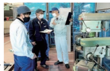
Health and Safety Support Project

We hold seminars on process improvement and information security measures at our suppliers' manufacturing sites as needed to improve their capabilities. At product exchange meetings, we communicate and exchange opinions with workers on-site. We also conduct workplace checks of our suppliers using our Health and Safety Support Project.