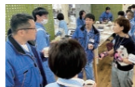
A DEI MeetUp! Session