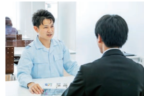
Solutions-based communication to solve customers' problems